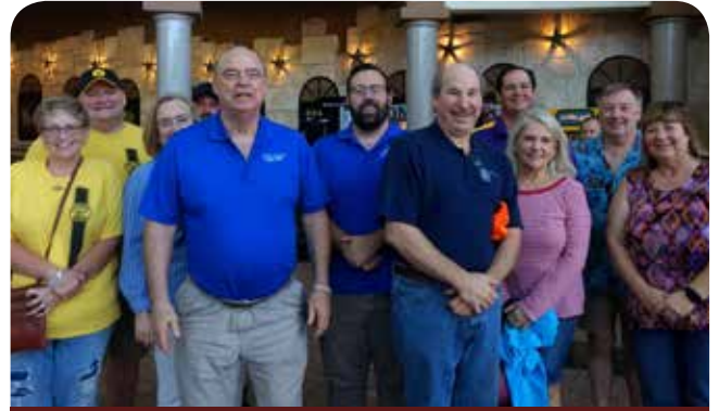
The TyRex Family enjoys a group outing to see "The Meg" movie