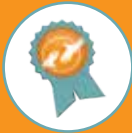
RecognizeGood ® Illuminating GOOD in Our Community