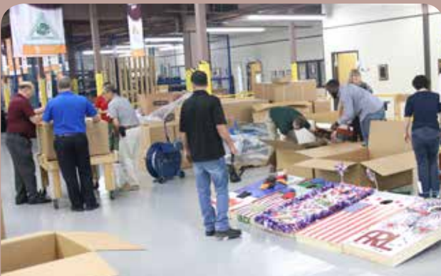
The TyRex TEAM comes together to package Mobility Carts

The TyRex Family built and sent off 63 mobility carts to those in need through MedShare, a nonprofit that recovers surplus medical supplies and equipment. Thank you to all the volunteers who donated their time by building and packing these life-changing carts.