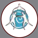
TyRex Learning Foundation