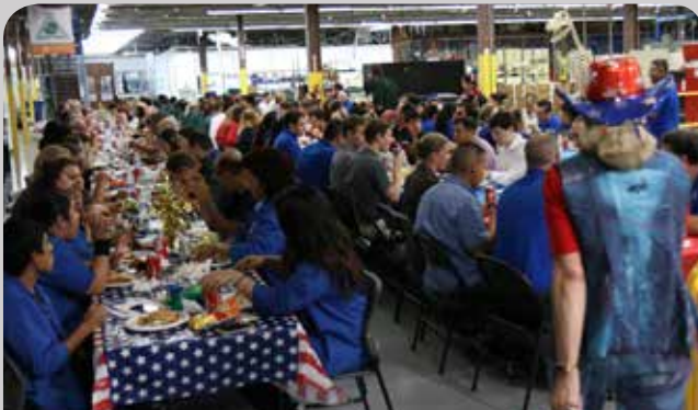
The TyRex Family gathers together to enjoy BBQ

The TyRex Family had a great time celebrating Independence Day with a bag-toss board decorating competition! All of the entries took decorating to a whole other level! Winners were announced at the TyRex Independence Day lunch where all the companies came together for great BBQ and a bag-toss competition. Coming in 3rd was iRex, while Megladon finished 2nd and ARL's board stole the show, by winning first-place honors. Thanks to everyone who participated in this friendly company competition!