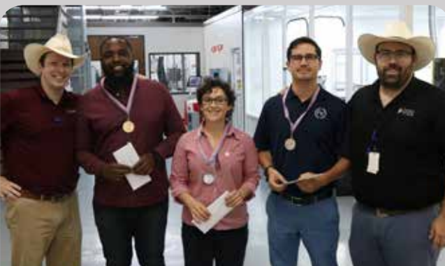
Bag-toss competition winners from the celebration