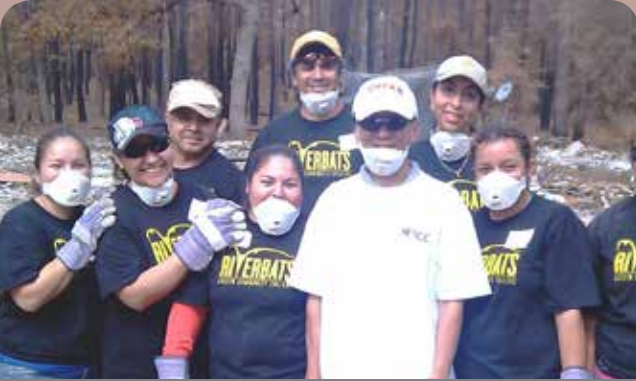
iRex Family members volunteer in Bastrop after the 2011 wildfires