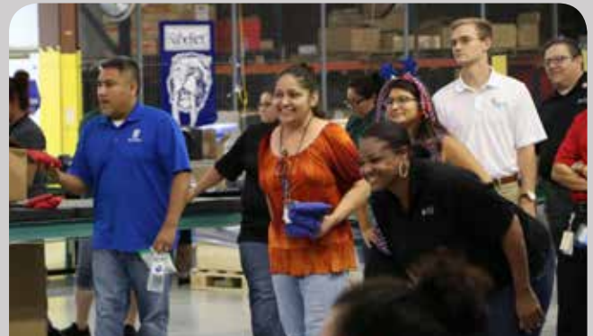
TyRex Family members compete in the bag-toss competition