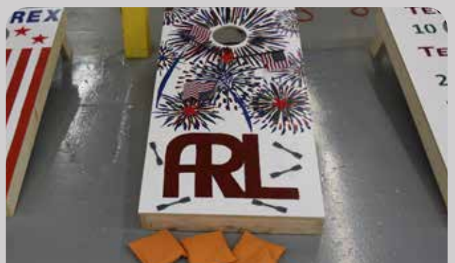
ARL wins the bag-toss board decorating contest