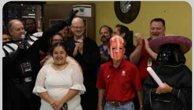
TyRex Family members compete in a Star Wars costume contest