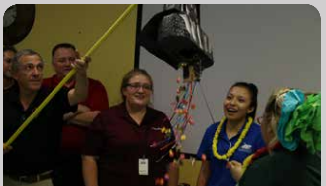
Celebrating with a festive Darth Vader piñata