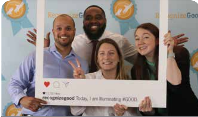
The DLI team enjoying the photo booth at the Ethics in Business Luncheon