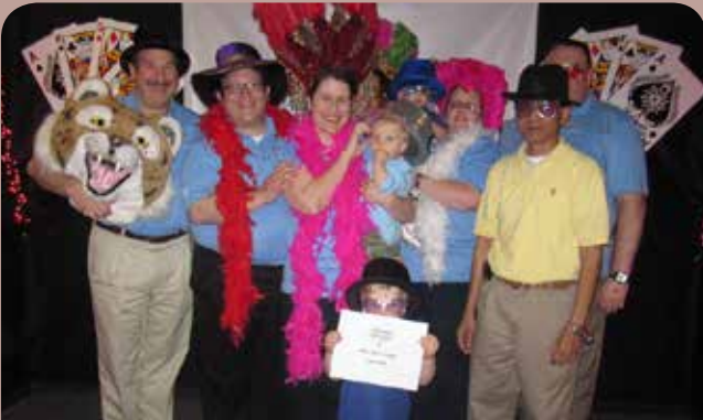
TyRex Family members volunteer at Big Brothers Big Sisters Bowl for Kids 2012