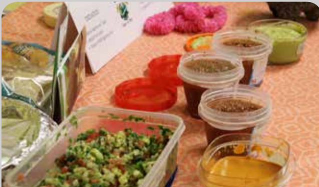
Salsa contest entries from the TyRex Family