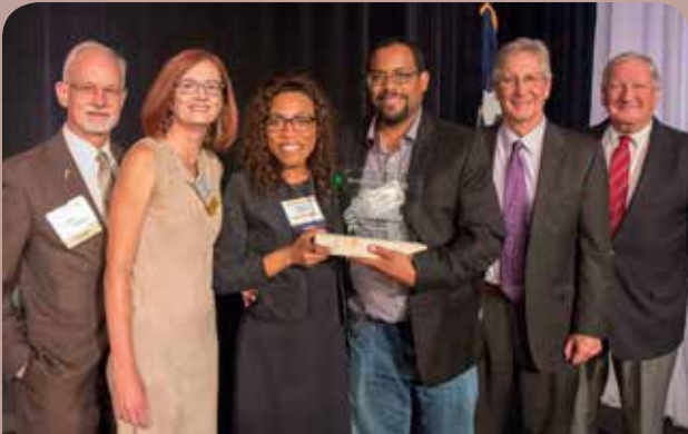
Survive2Thrive receiving the 2018 Nonprofit Award