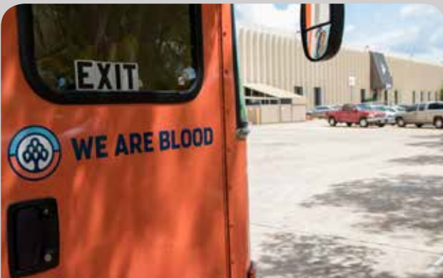
We Are Blood's Blood Bus parked outside of the TyRex facility

TyRex would like to thank all our Technology Boulevard neighbors for joining us at our second Donation Day in 2018! We had 19 donors give to We Are Blood, collected 344 lbs of donations for Goodwill Central Texas and received over 50 children's books for BookSpring!