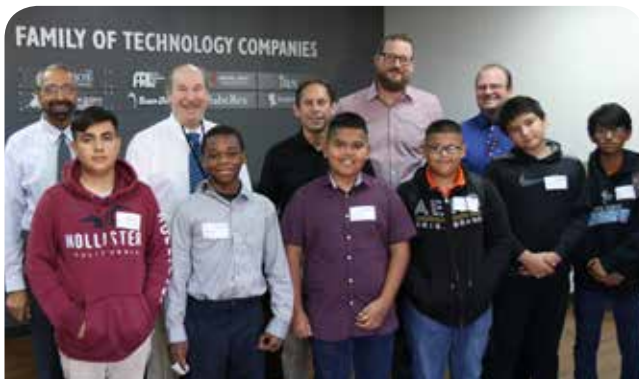
The TyRex Family hosts middle school students for CEO For a Day