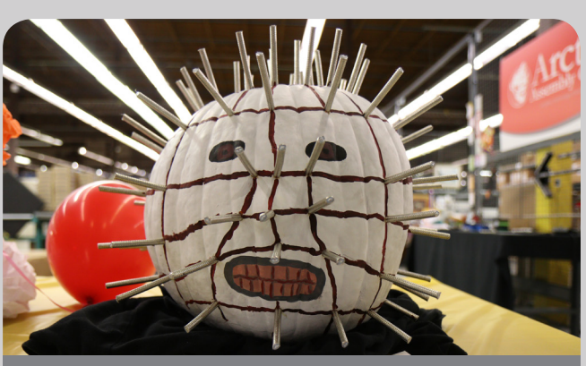
Jamie Downing's Pinhead pumpkin from the movie Hellraiser