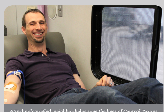
A Technology Blvd. neighbor helps save the lives of Central Texans