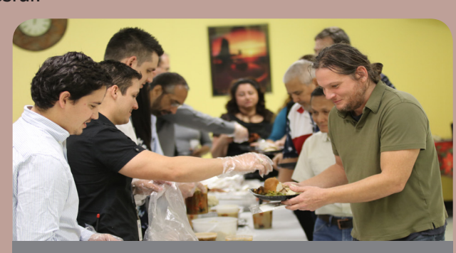
Employees enjoy a full Thanksgiving meal during our SAY THANKSgiving!