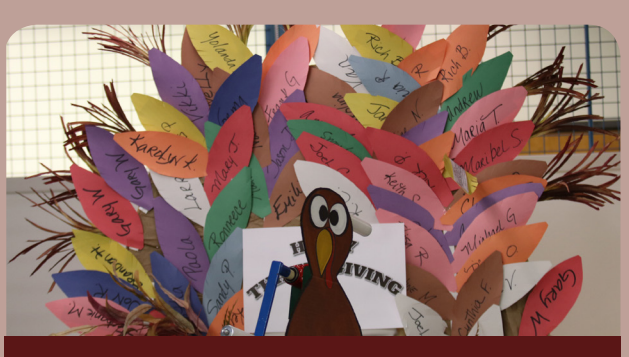
We have a lot to be thankful for at the TyRex Group!