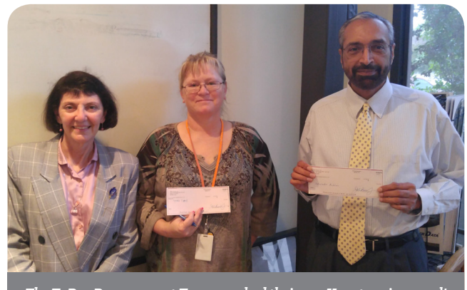
The TyRex Procurement Team reached their 300K cost savings goal!