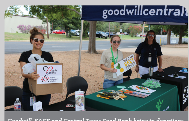
Goodwill, SAFE and Central Texas Food Bank bring in donations.