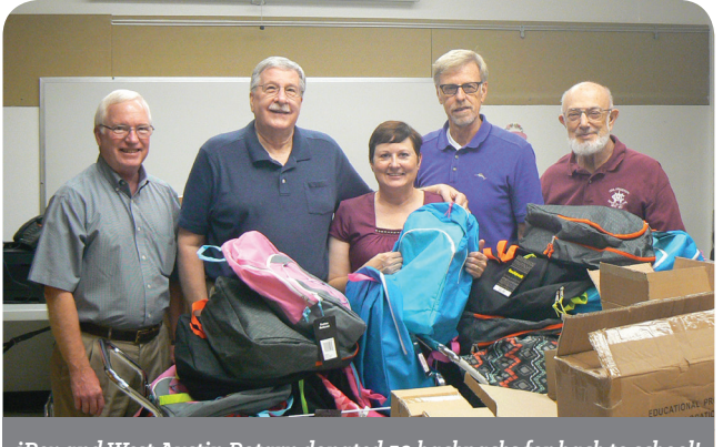
iRex and West Austin Rotary donated 50 backpacks for back to school!