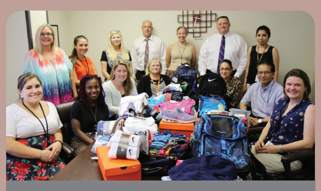
Teams getting things ready to deliver to their students