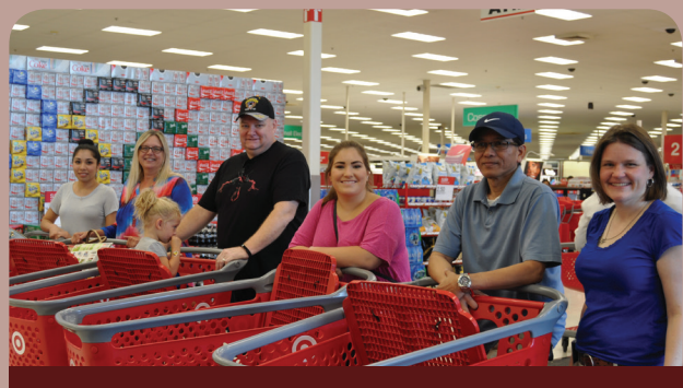
TyRex employees get ready to shop at Target.

Twenty TyRex Family members teamed up this year to send a group of kiddos in need back to school in style! Through a partnership with Tarrytown United Methodist Church, teams of two knocked out each student's back to school list. Teams took time out of their lunch breaks or weekend to hit the stores. Each team was assigned a specific student from ages 6 to 17 to buy five outfits and other school essentials. Thanks to everyone who supported this fun community service project!