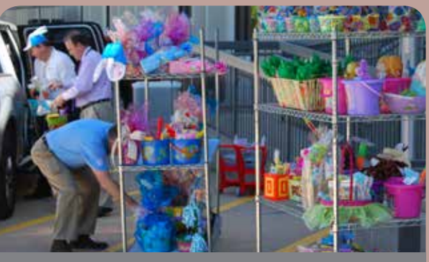
TyRex Leadership loads up the baskets for delivery to SAFE Alliance!