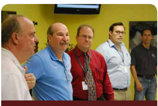
TyRex leadership thanks all employees for their hard work and support!