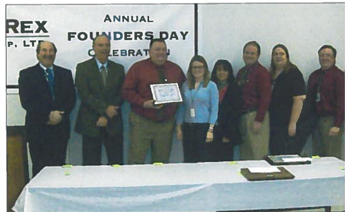
Circle of Business Trust Division Winners, iRex CCG