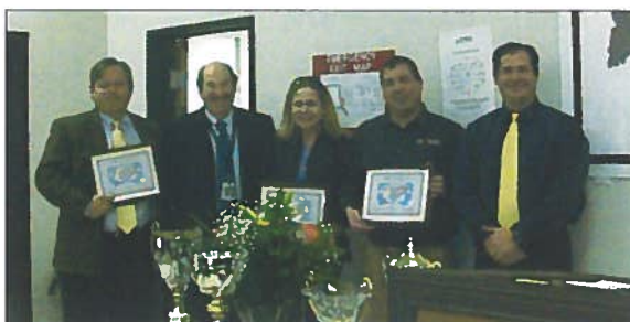
Economic Prosperity Winners DLI, SabeRex, SabeRex ATS