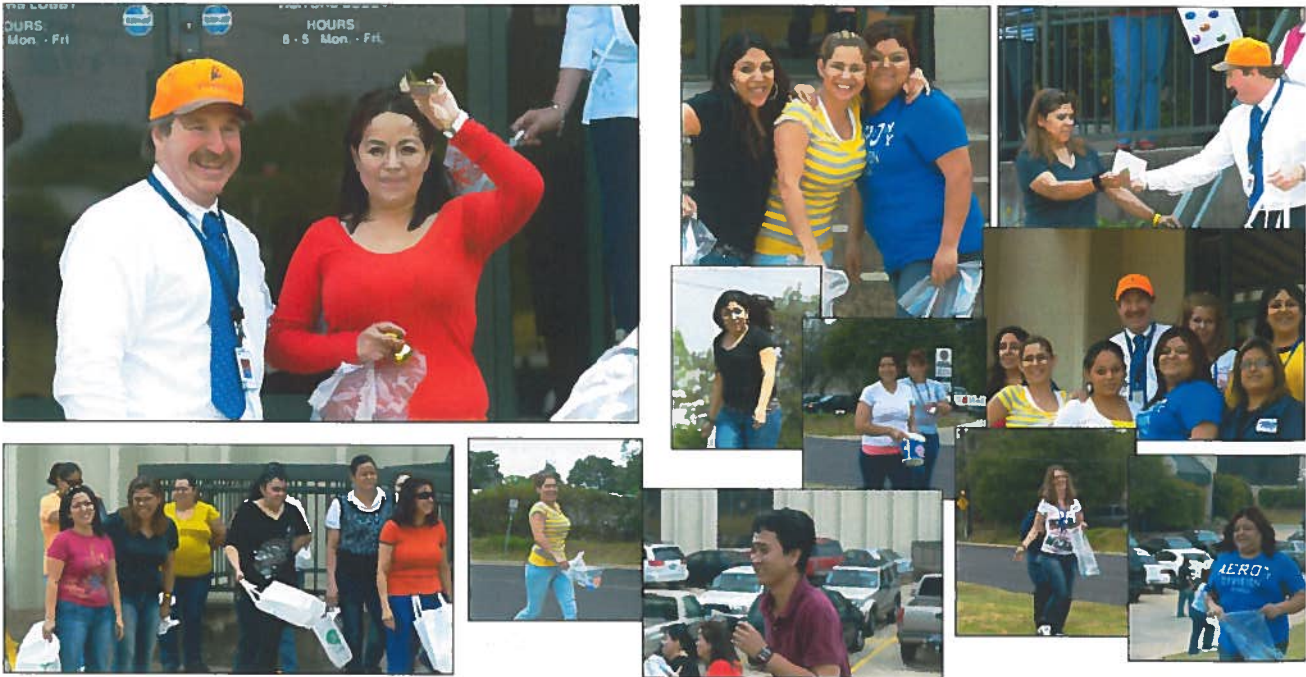
TyRex Employees take part in the annual Easter Egg Hunt