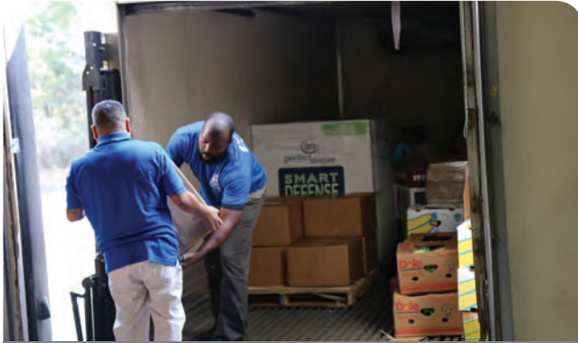
TyRex has now donated over 700lbs of food to the Central Texas Food Bank!