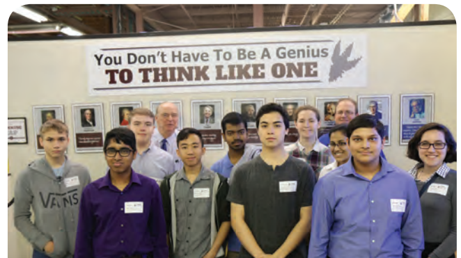
High school students join TyRex leadership for a job shadow day.