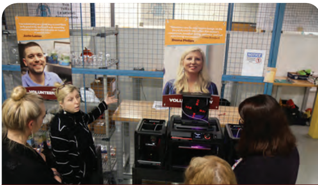
Eighteen employees have now received their 3D printing certificates.