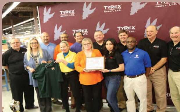
The TyRex Cost Procurement Team is honored for their hard work.