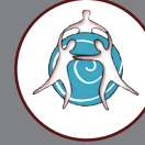
TyRex Learning Foundation