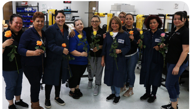
Happy Valentine's Day from the TyRex Family!