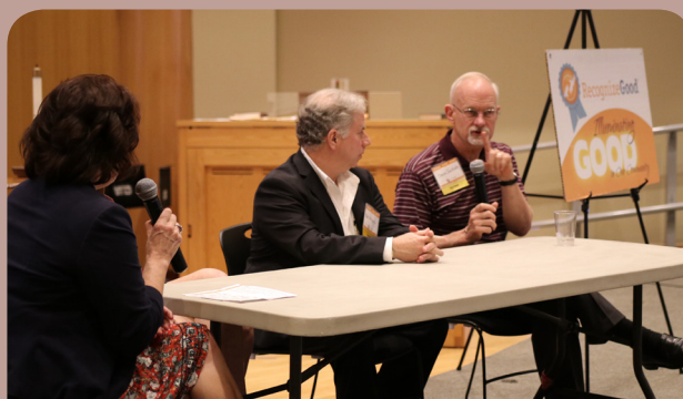
Leaders from alumni Per Stirling Capital Management and Capital IDEA