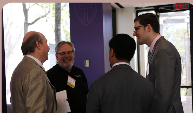
TyRex leaders chat with Concordia students about this year's awards

TyRex's signature non-profit organization, RecognizeGood, announces its annual Ethics in Business Award finalists each year on CBS Austin's "We Are Austin" show - but not before inviting all past award winners to a reception hosted by Concordia University Texas. This year's alumni reception provided us with a great opportunity to network with like-minded business leaders and share our own example of doing the right thing in our businesses.