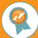
RecognizeGood ® Illuminating GOOD in Our Community