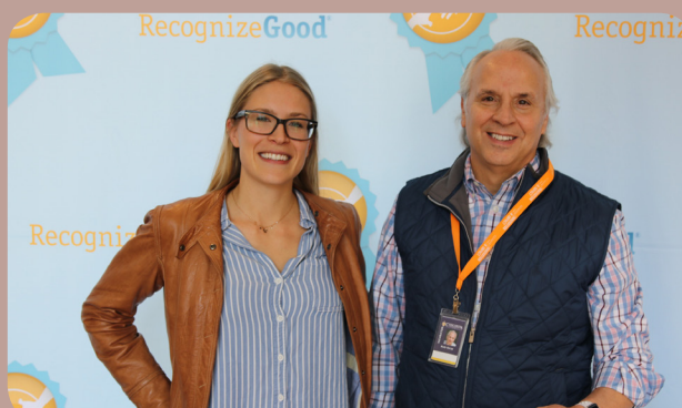
2019 nominees pose in front of our RecognizeGood background