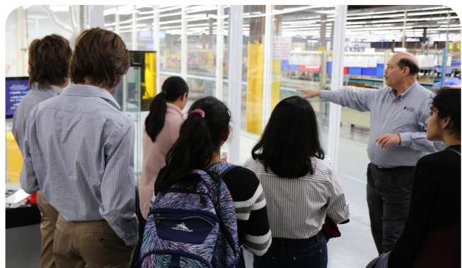
Westwood High School students enjoyed a half-day TyRex job shadow.