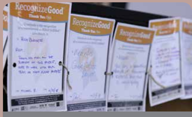
RecognizeGood Thank You Notes from the TyRex Family