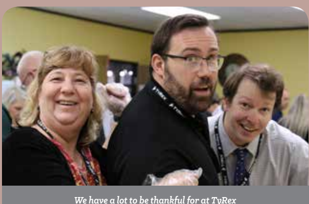
We have a lot to be thankful for at TyRex