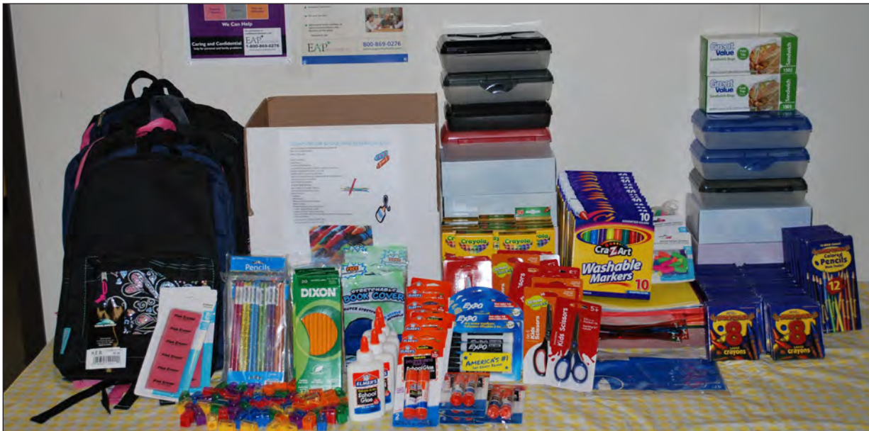
Megladon collected a great deal of back to school supplies to be donated to local kids

iRex, SabeRex and TyRex, and are greatly appreciated. There are too many people involved in this program to thank, so on behalf of Gause Elementary, thank you all for your generosity and commitment to the education of the youth in this beautiful community we call home.