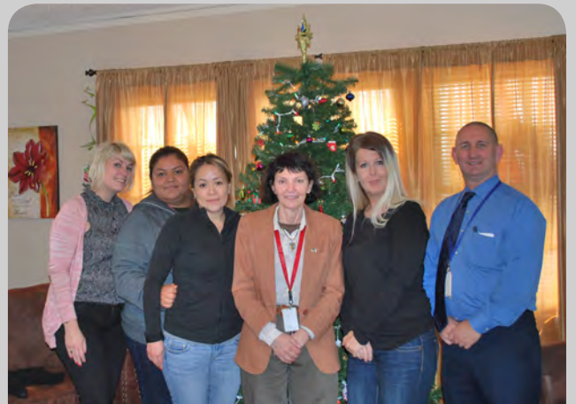
Megladon employees brightened one home for the holidays