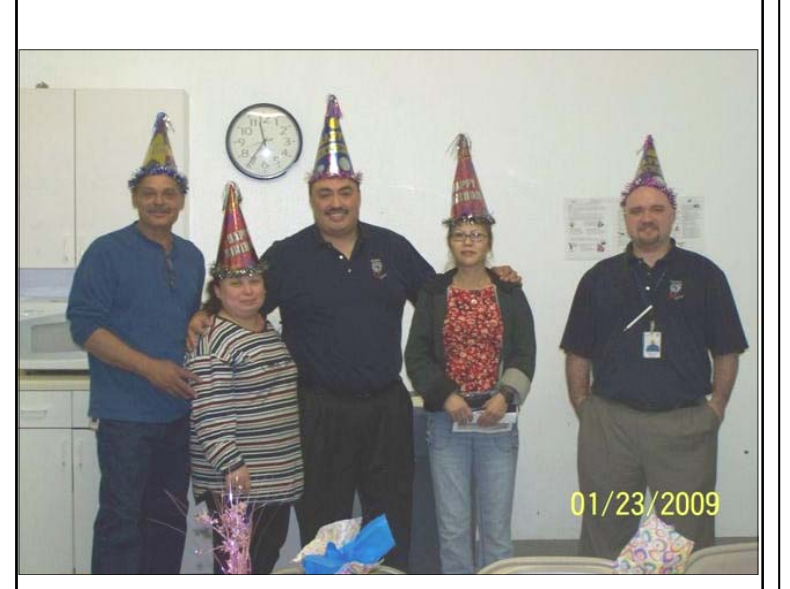
Delta celebrated the January birthdays in style.