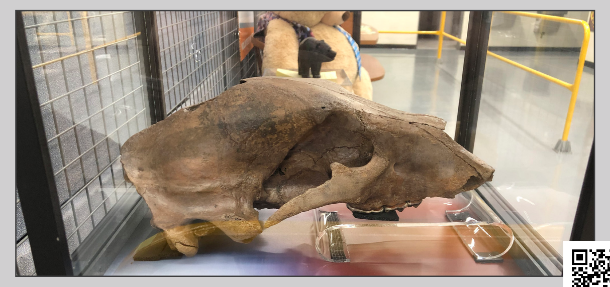
Cave Bear Skull

Log on to the TyRex Family Album (TFA) to see our Fossil of the Month. In this quarter we've featured a cave bear skull, diplodocus foot bone, and pterasaur claw. Stay tuned for more fossil and join the discussion on the TFA!