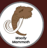
Woolly Mammoth 3D