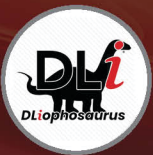
Digital Light Innovations